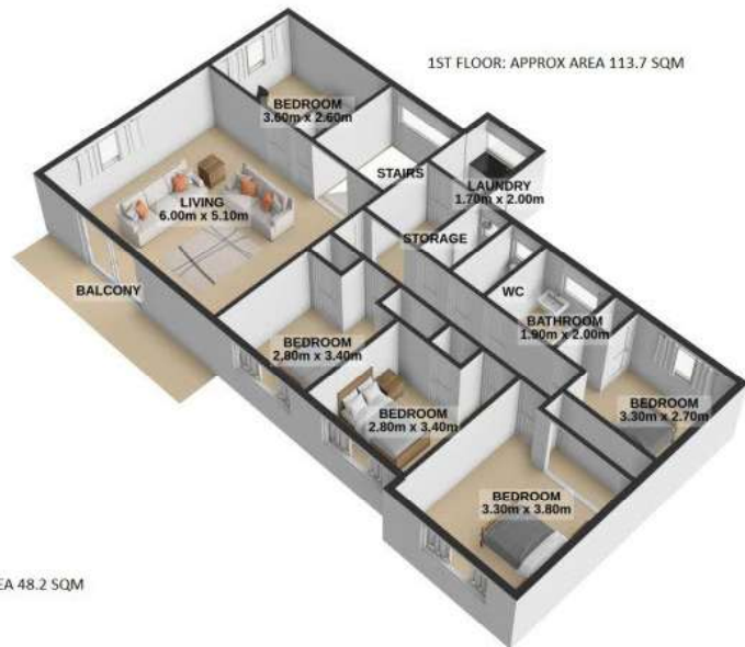
1ST FLOOR: APPROX AREA 113.7 SQM