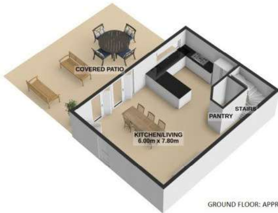
GROUND FLOOR: APPROX AREA 48.2 SQM

Floor plans have been created for marketing purposes only. Floor areas include garages unless stated otherwise. Whilst all care has been taken to ensure information is correct, we do not take responsibility for any inaccuracies. Floor plans cannot be reproduced without the written consent of Photo Plan.